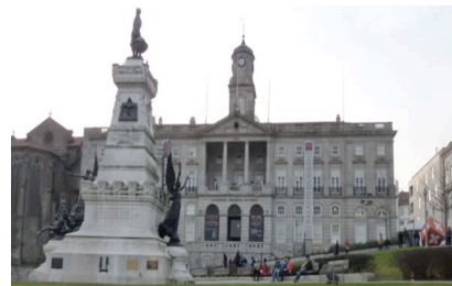
Palácio da Bolsa